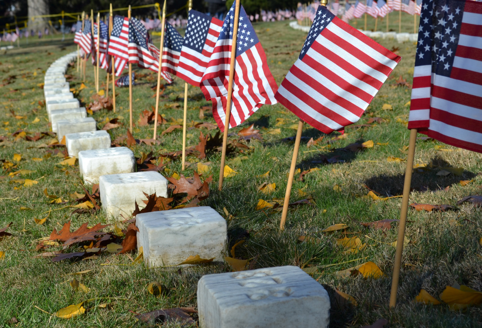
The graves of unknown Civil War soldiers buried at Gettysburg National Cemetery.